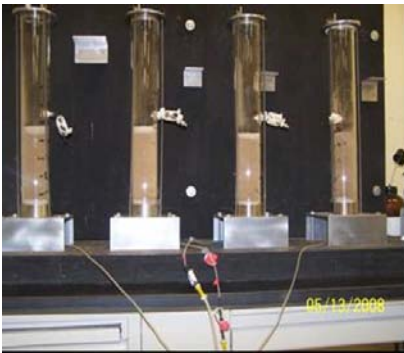
Figure 1. Flow-through columns.

The Applied Research Center at Florida International University (ARC-FIU) is assisting the U.S. Department of Energy's (DOE) Oak Ridge Reservation (ORR) in developing solutions to mercury contamination in soil, sediment and water, including the incorporation of emerging technologies for the efficient management of mercury-contaminated materials. This task focused on laboratory tests to determine mercury transport parameters and adsorption/desorption ( K_d ) coefficients in ORR soil to support complex watershed model development via the use of experimentally determined input values.