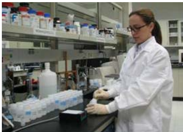
Figure 2. Preparation and testing of carbonate buffers